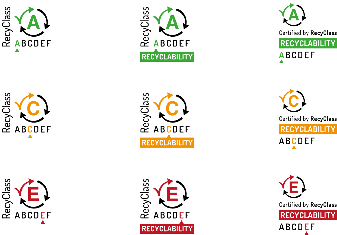
Figure 2. Recyclability logo - Examples Class A, C & E

Certification holder may claim recyclability for their packaging and may use the logo found in Figure 2 for communication purposes in line with the guidance laid out in the following sections.