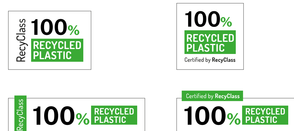
Figure 3. RecyClass Recycled Plastics Traceability logo - Example 100% recycled plastics